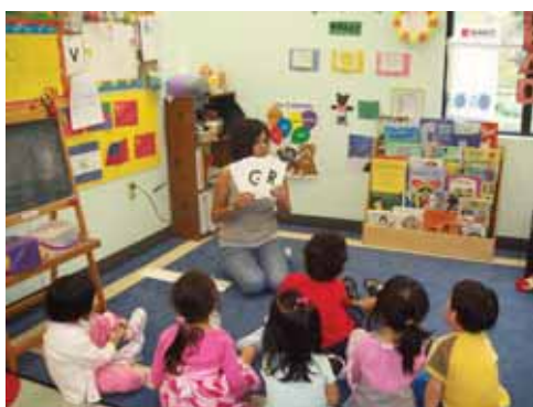
Childcare instructor giving a lesson on the alphabet.

The accreditation follows many improvements to the childcare including the installation of a naturescape playground with lush rolling hills, a bamboo forest, and an increased focus on interactive education. It also marks the beginning of a new concentration on family involvement, online tools for parents, and mentoring.