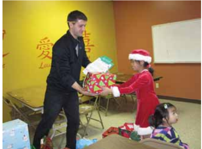
(Top): An afterschool child is all smiles as she receives her Christmas present