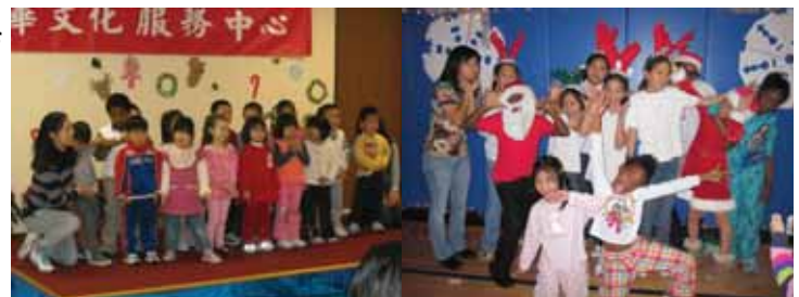
(Left): The Childcare's Two Year Old Room performing Holiday songs for the Open House guests.

2010, the childcare and afterschool youth hosted a holiday program for their families that included skits, songs, Spectra Energy present distribution as well as a full turkey dinner for everyone in attendance. It was a festive evening to kick off the holiday season at the Center!