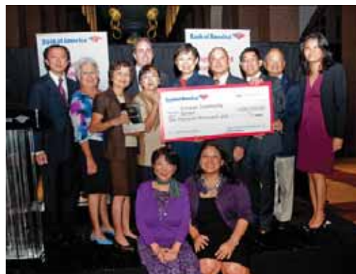
CCC Board Members and Staff celebrate while accepting the NEI check!

Since the Initiative's inception in 2004, the program has helped over 500 non-profit organizations succeed in helping their local communities. This is the beginning of Bank of America's 10-year goal to donate $2 billion to nonprofit organizations engaged in improving the health and vitality of their neighborhoods.