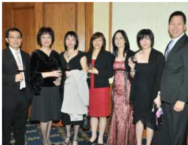
Attendees enjoy a gala reception prior to the event's start. The cocktail hour allowed guests to browse the over 100 "mystery box" items, silent auction packages, and live auction items offered throughout the night.